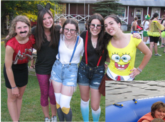
Dorm girls enjoying Carnival.