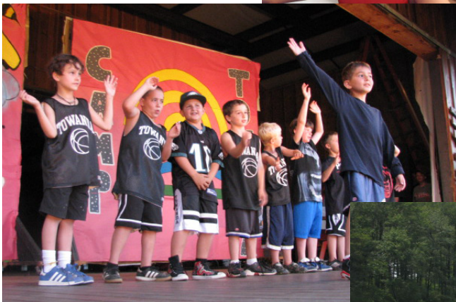
Jet Boys showing off their talents.