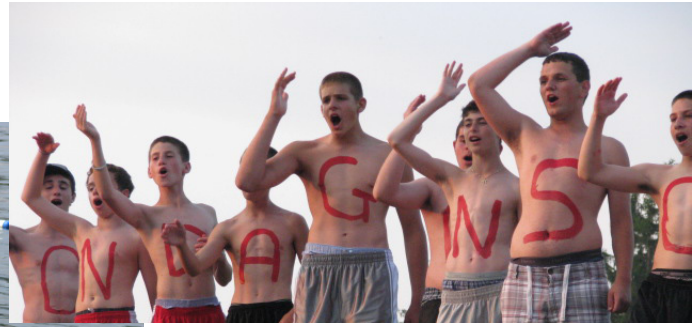
Club boys at Ron Dagan.